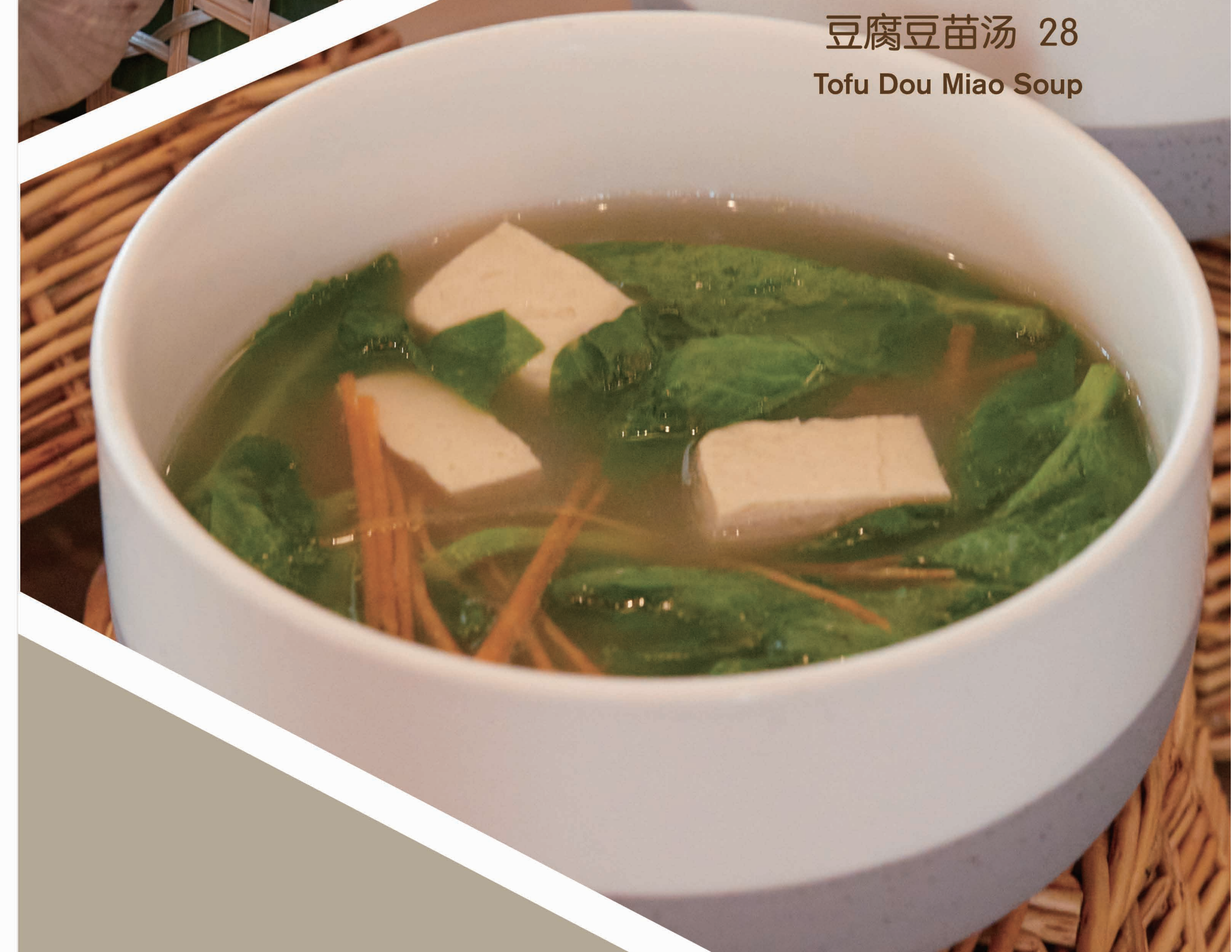
豆腐豆苗汤 28 Tofu Dou Miao Soup