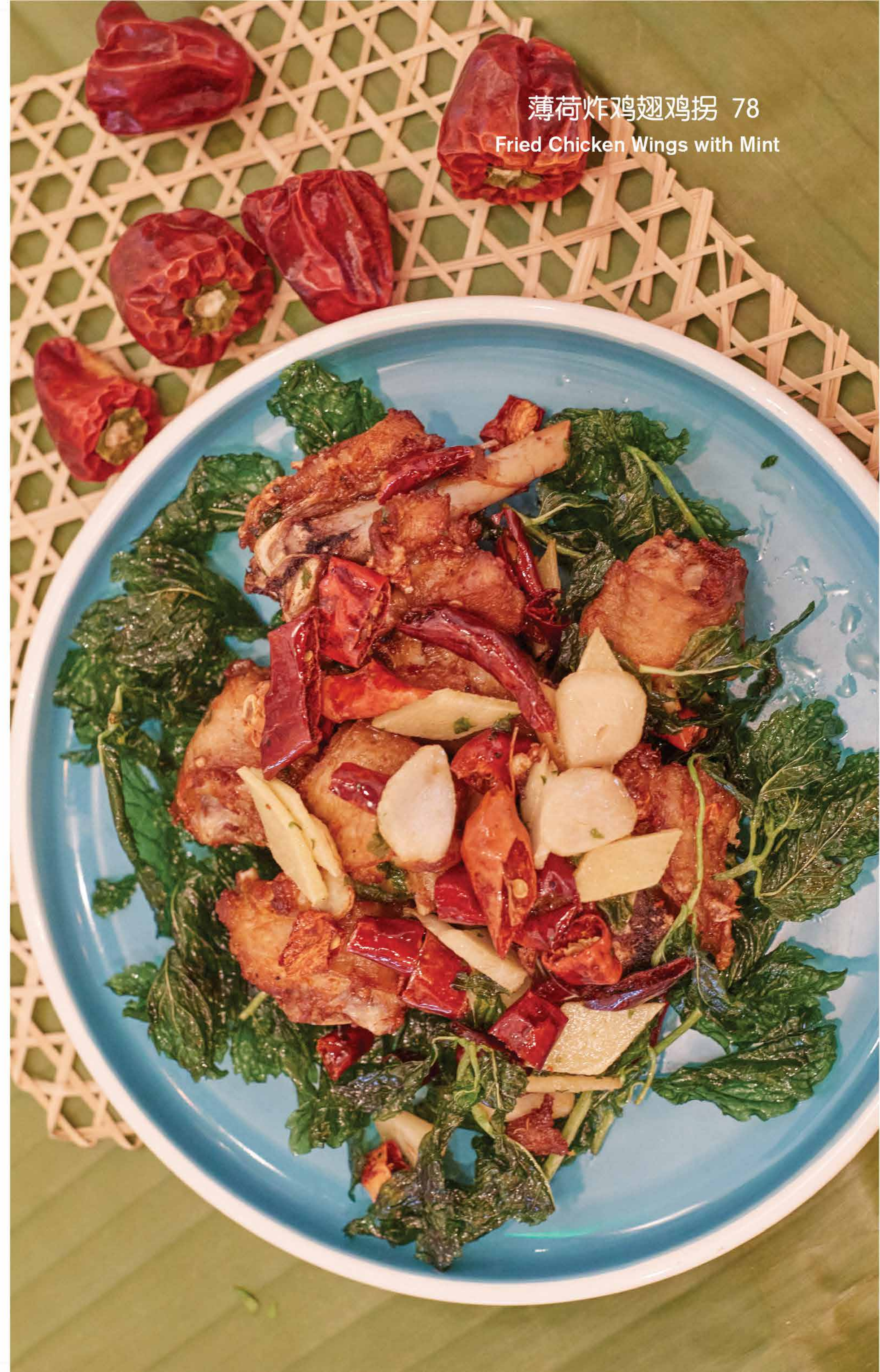
薄荷炸鸡翅鸡拐 78 Fried Chicken Wings with Mint