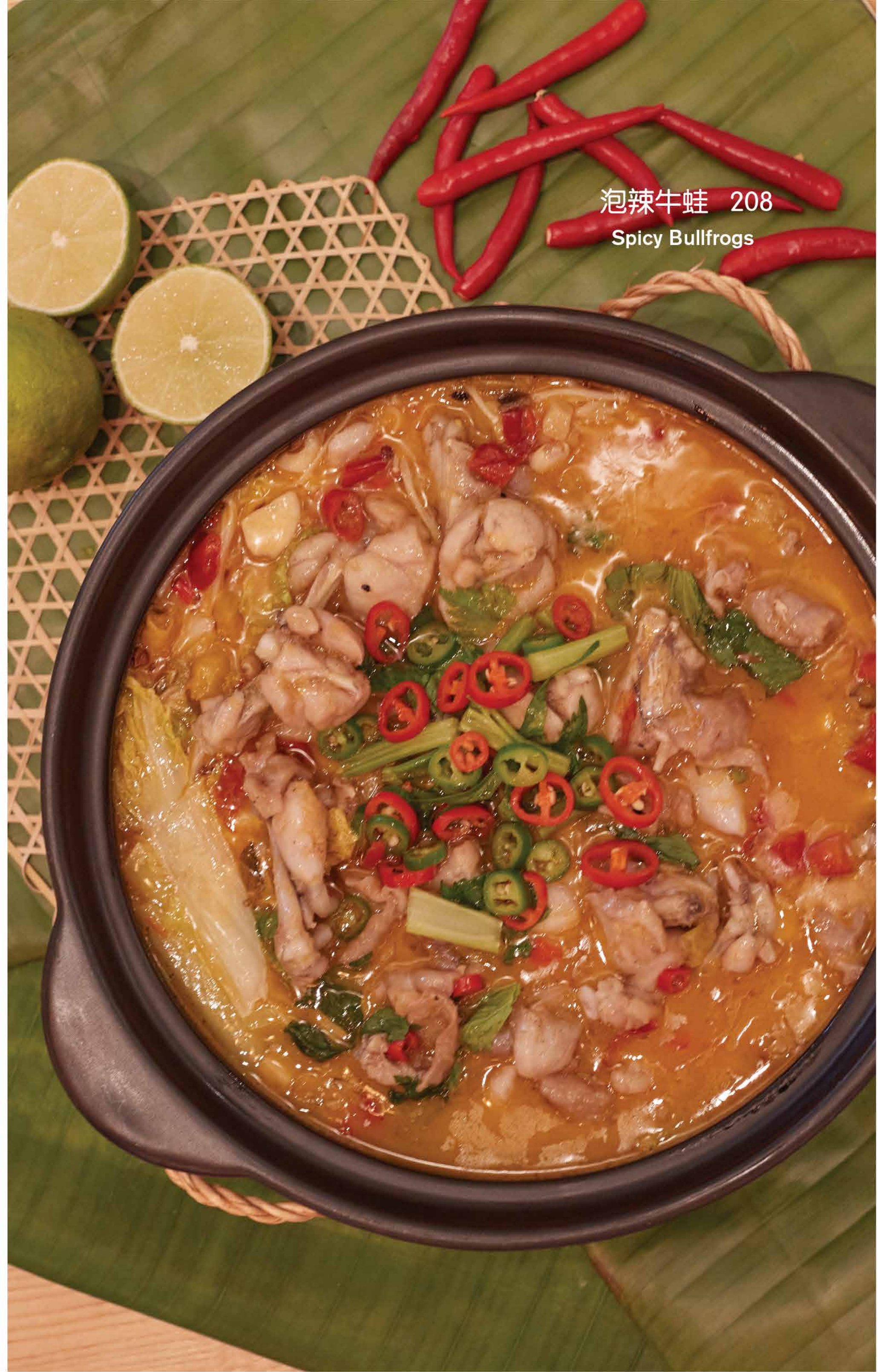
泡辣牛蛙 208 Spicy Bullfrogs