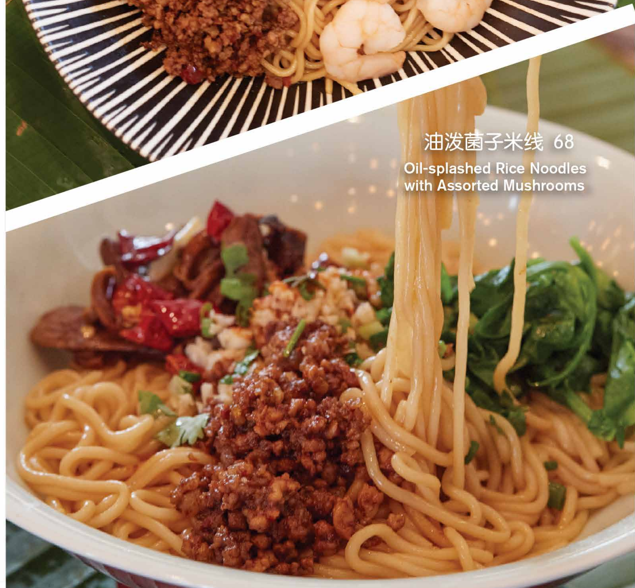
Oil-splashed Rice Noodles with Assorted Mushrooms