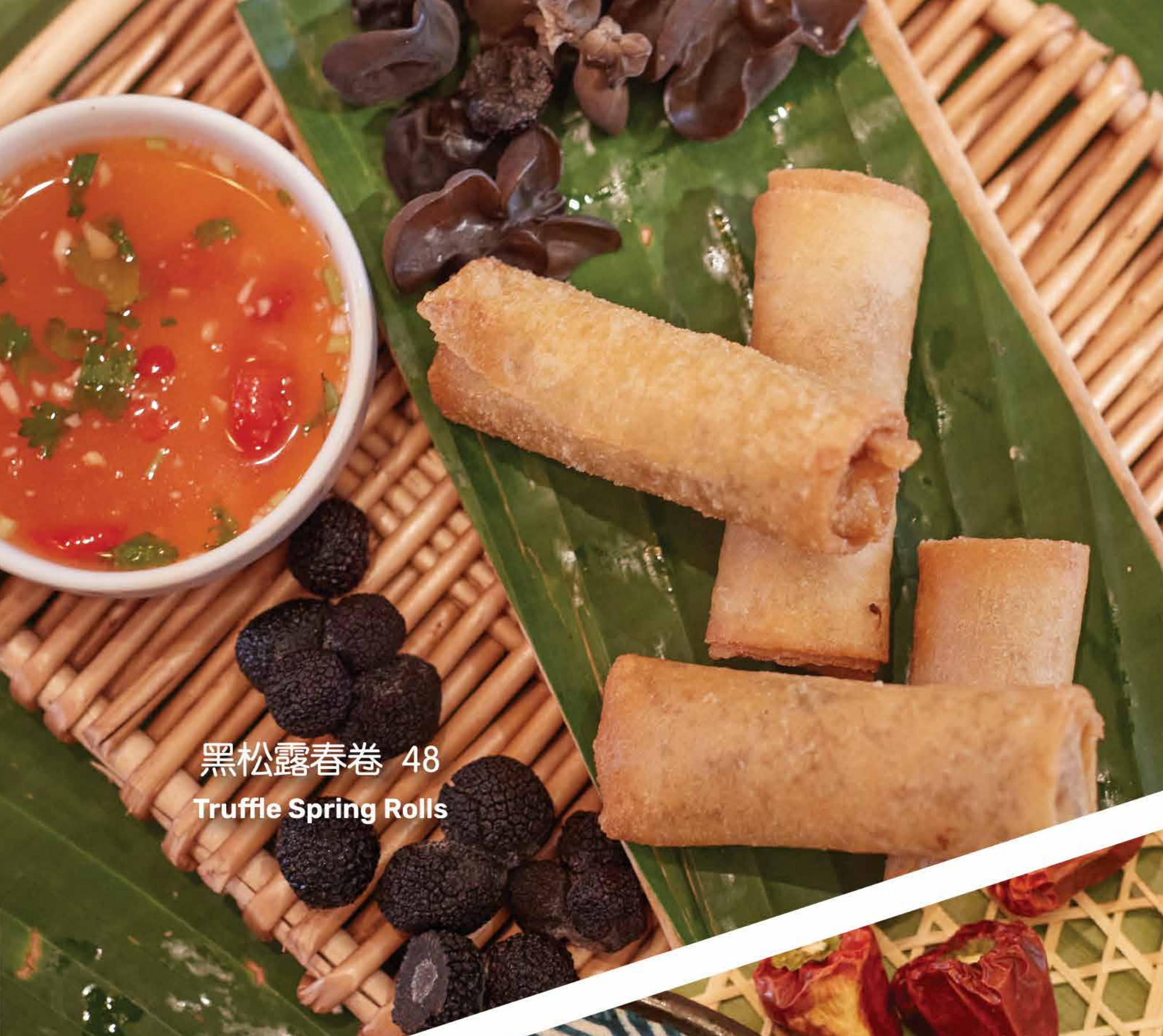
黑松露春卷 48 Truffle Spring Rolls