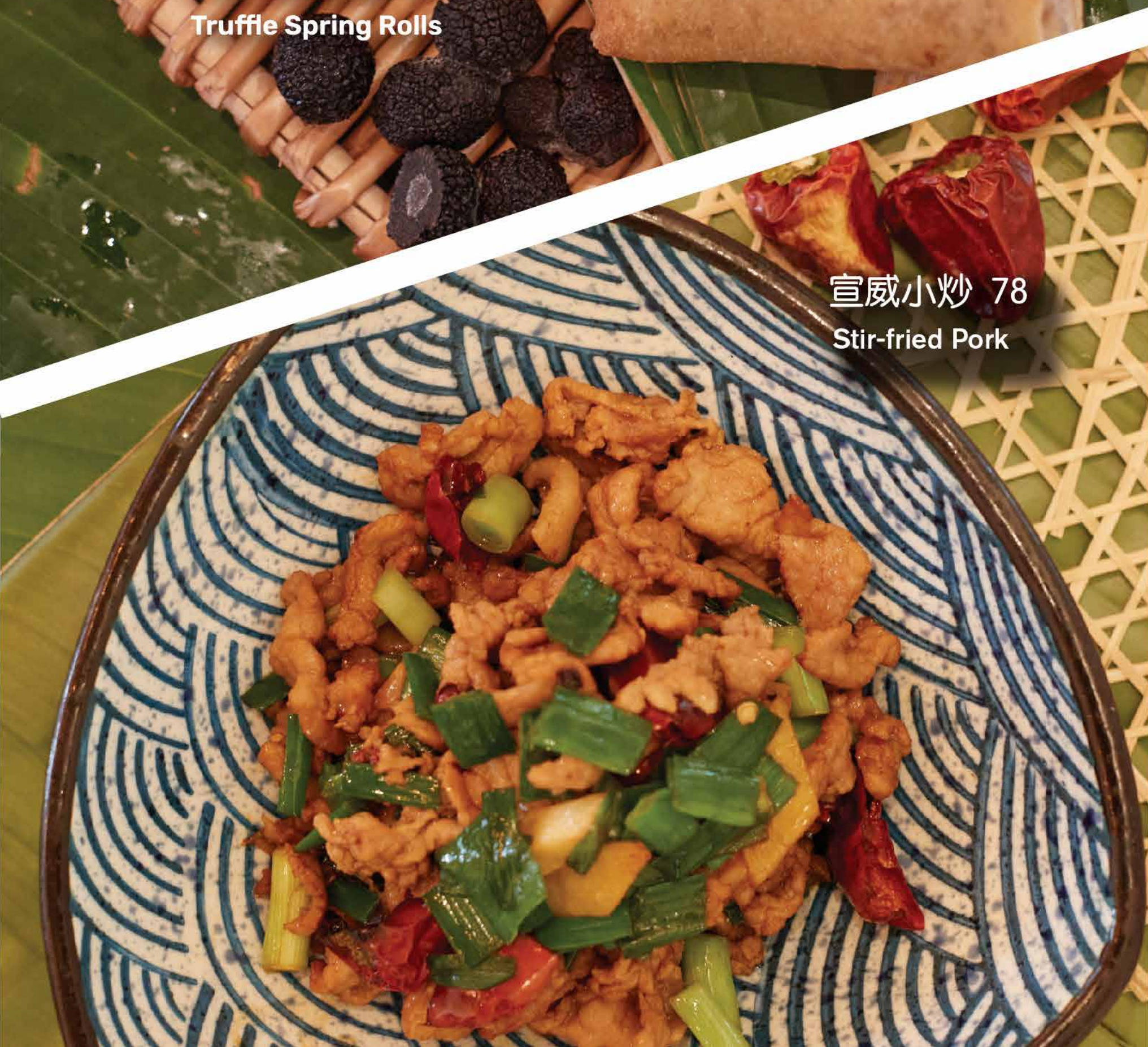
宣威小炒 78 Stir-fried Pork