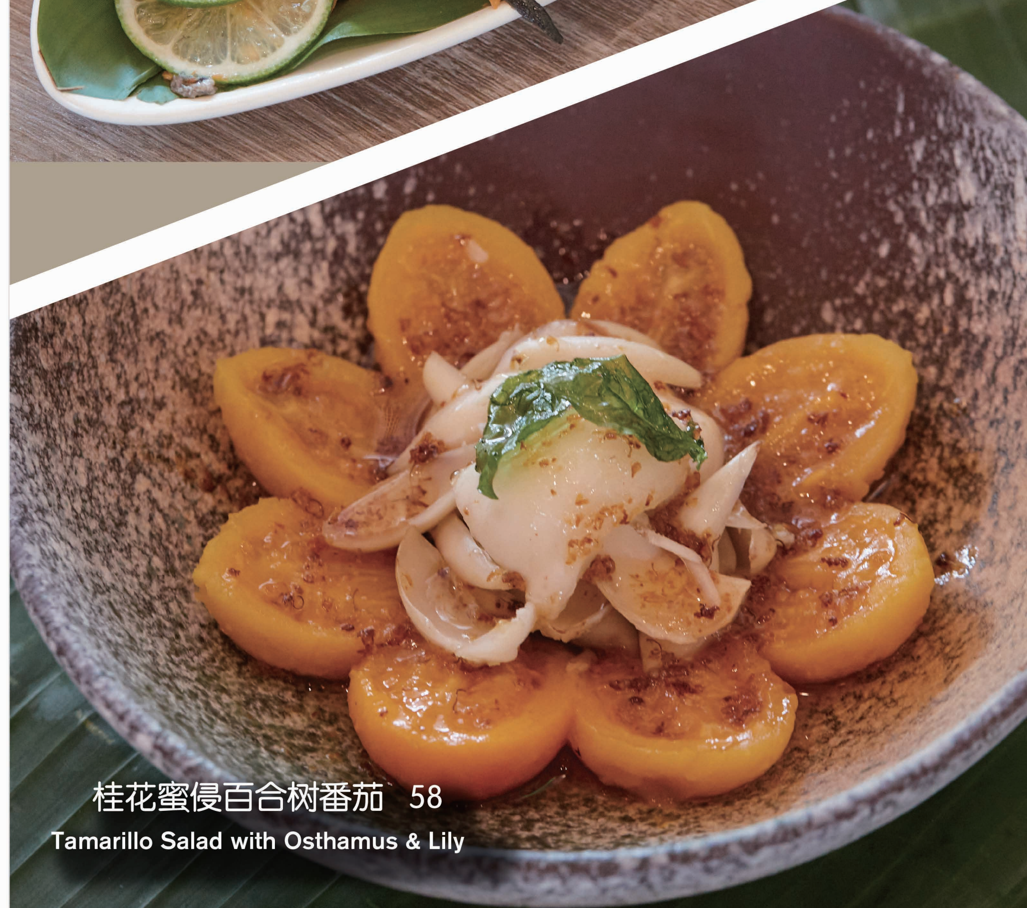
桂花蜜浸百合树番茄 58 Tamarillo Salad with Osthonus & Lily