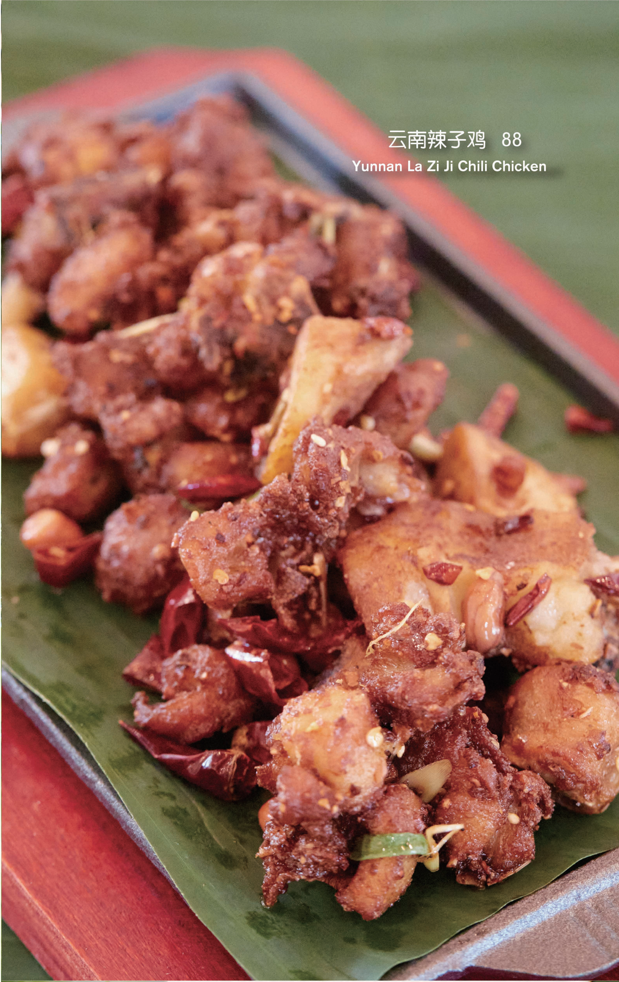
云南辣子鸡 88 Yunnan La Zi Ji Chili Chicken