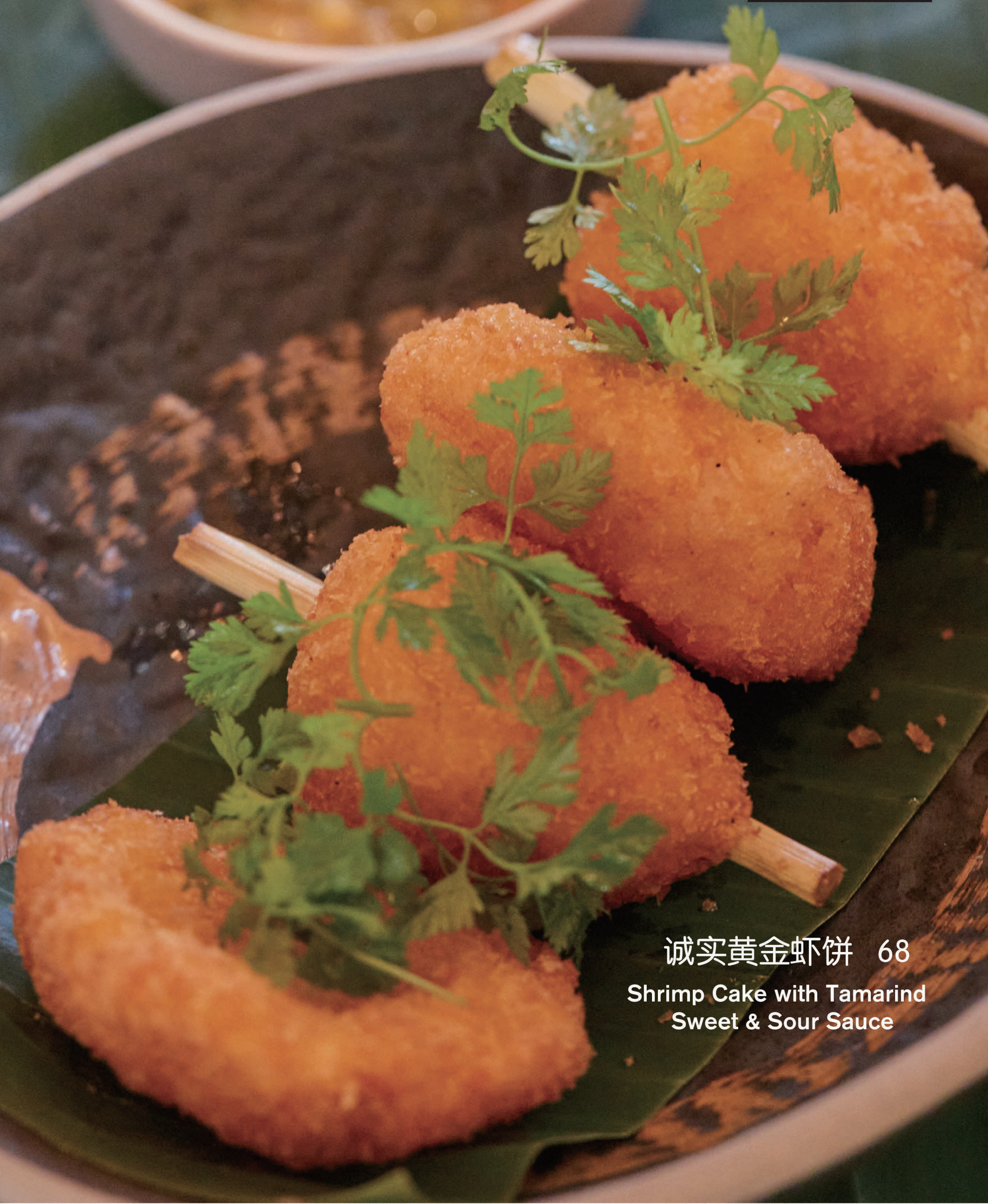
诚实黄金虾饼 68 Shrimp Cake with Tamarind Sweet & Sour Sauce