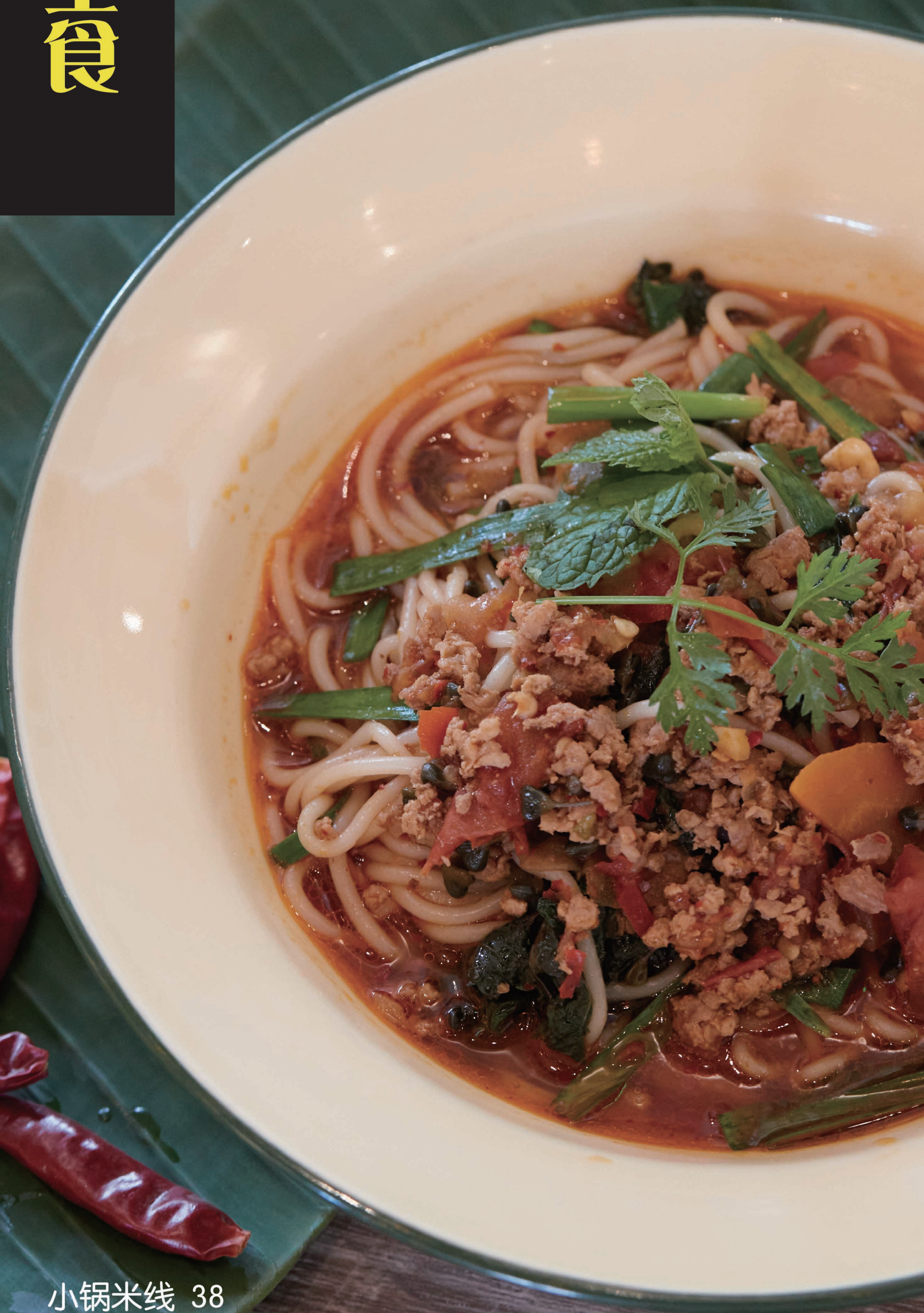
小锅米线 38 Small Pot Rice Noodles