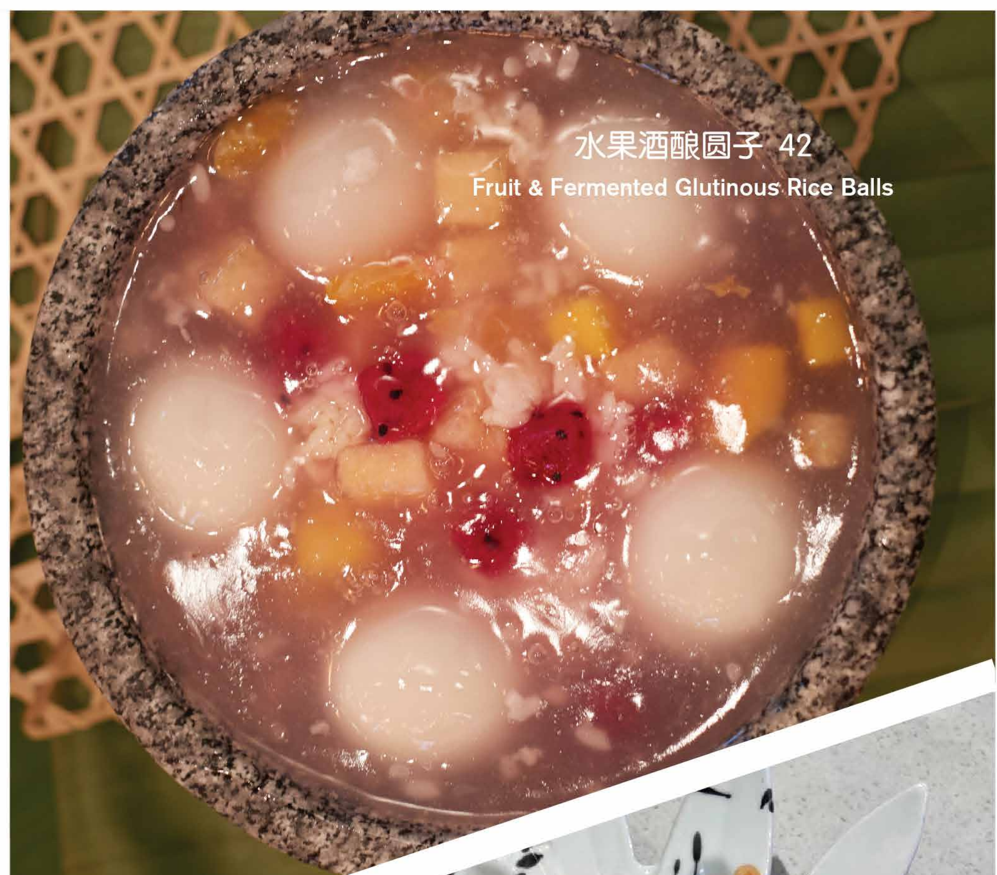
水果酒酿圆子 42 Fruit & Fermented Glutinous Rice Balls