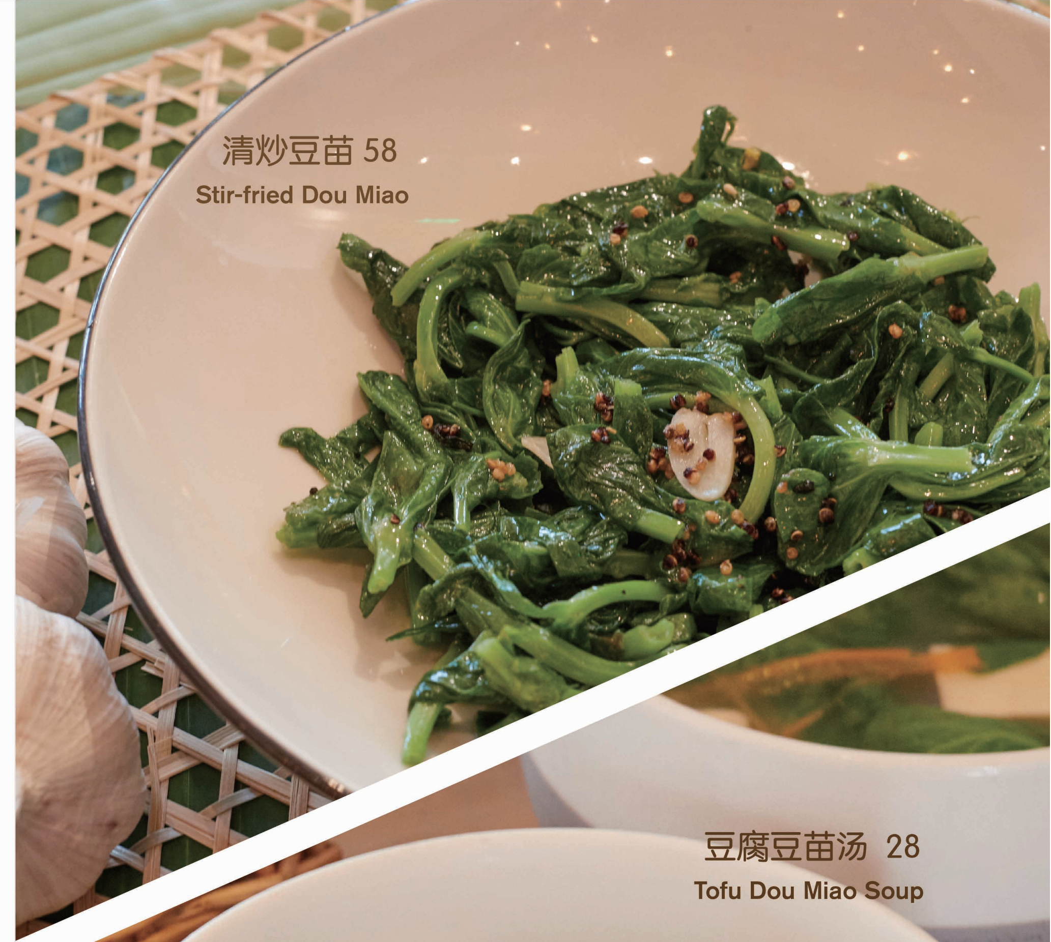
清炒豆苗 58 Stir-fried Dou Miao