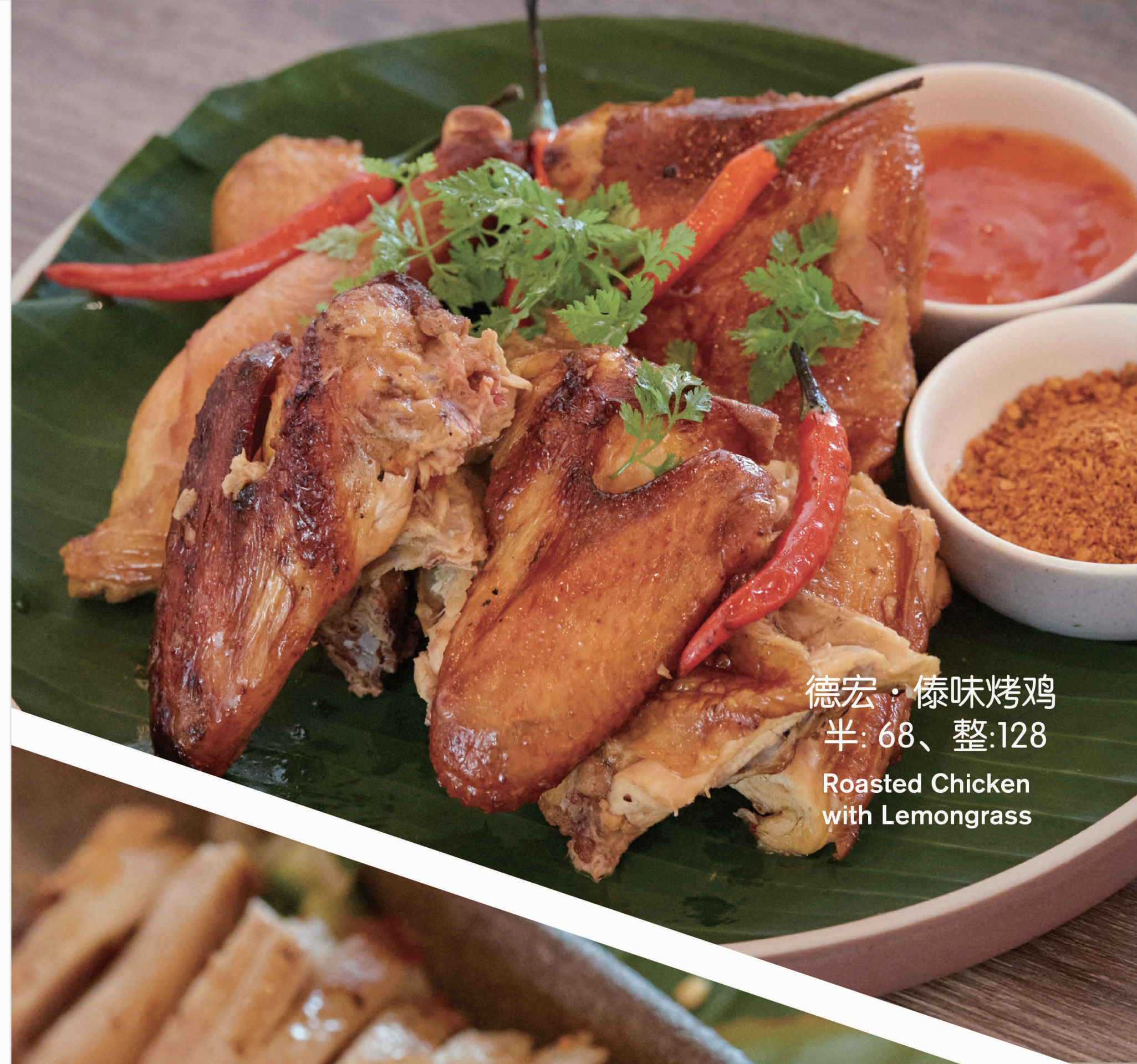
德宏·傣味烤鸡 半: 68、整: 128 Roasted Chicken with Lemongrass