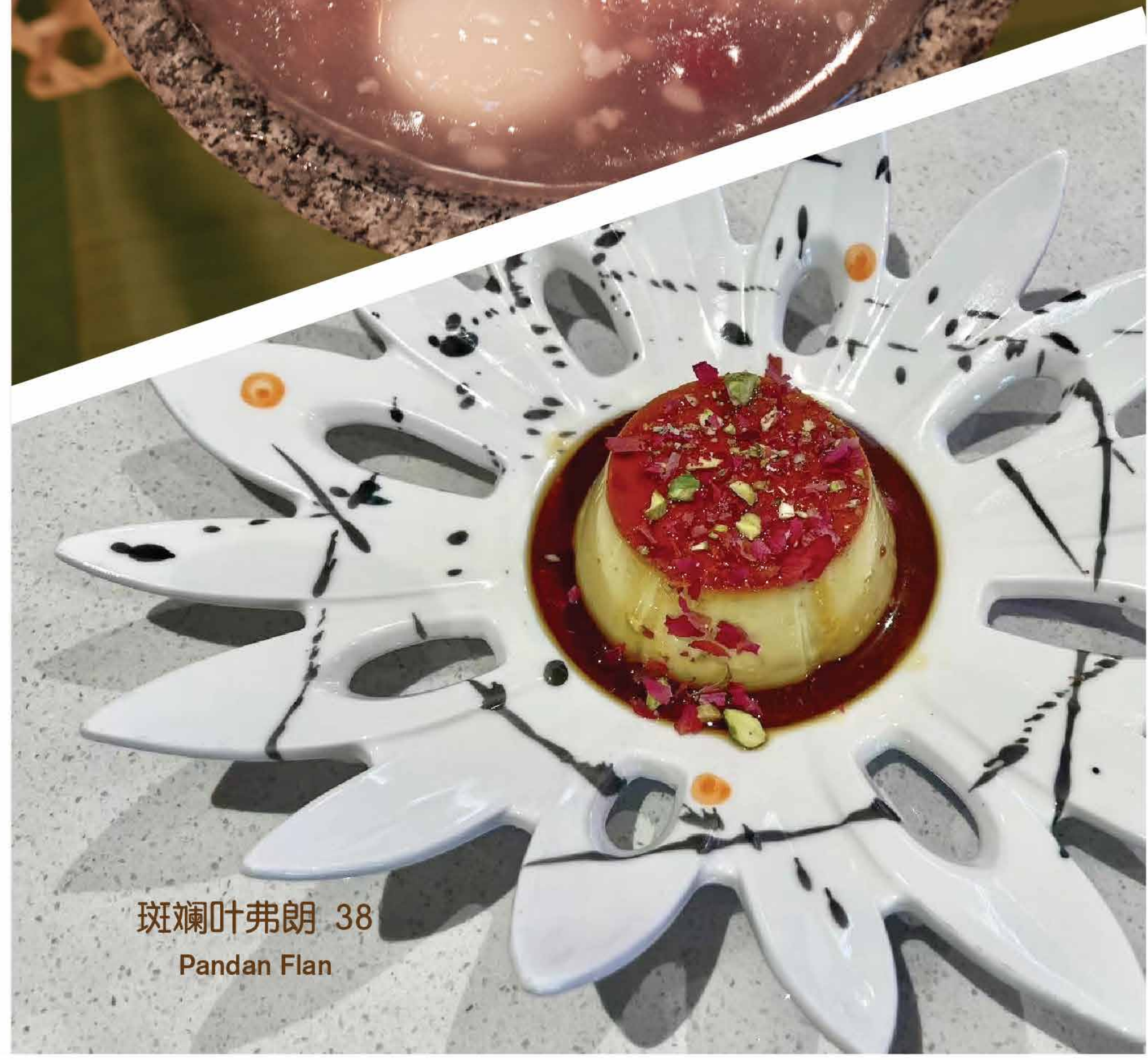
斑斓叶弗朗 38 Pandan Flan