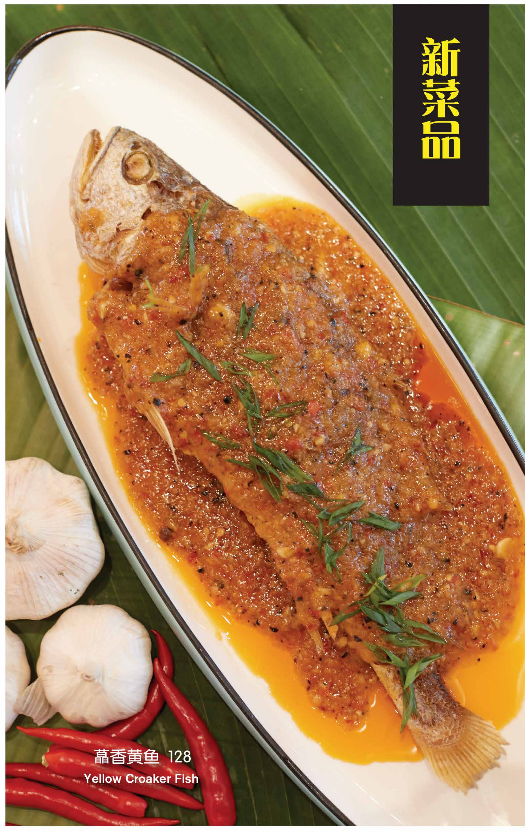
藟香黄鱼 128 Yellow Croaker Fish