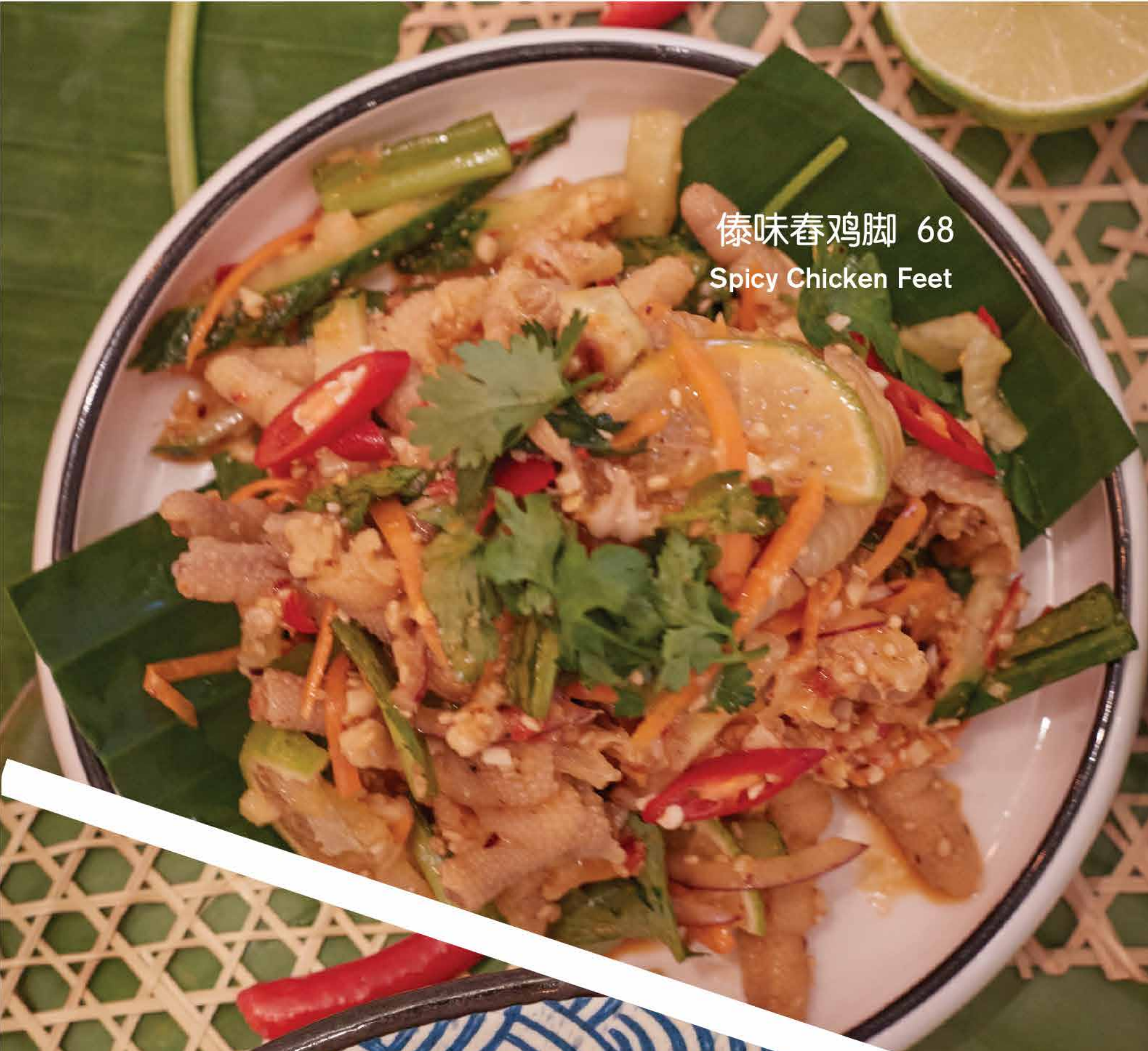
傣味春鸡脚 68 Spicy Chicken Feet