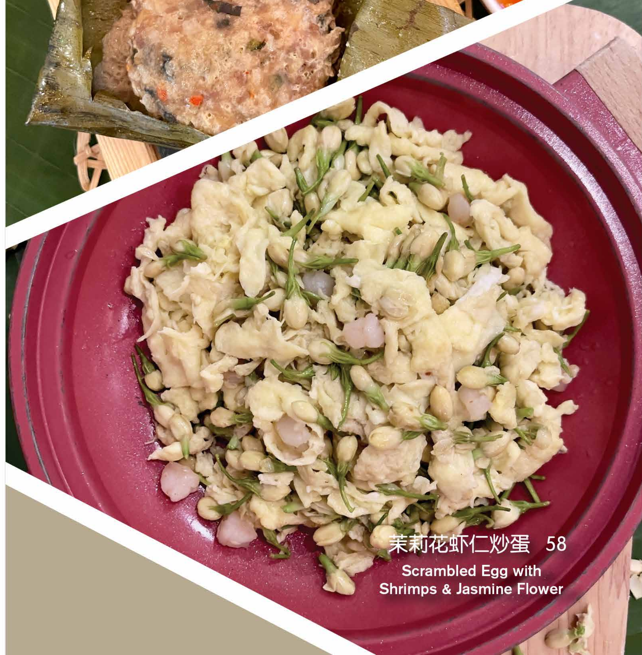
茉莉花虾仁炒蛋 58 Scrambled Egg with Shrimps & Jasmine Flower