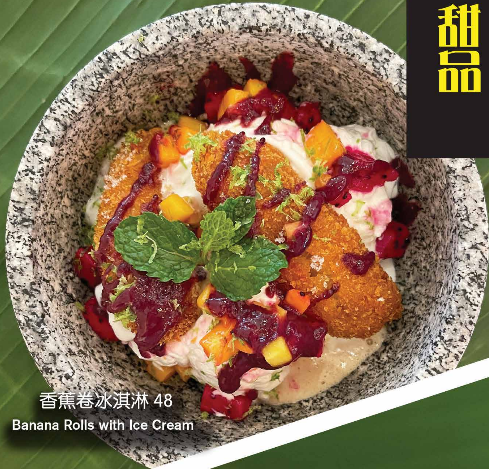
香蕉卷冰淇淋 48 Banana Rolls with Ice Cream