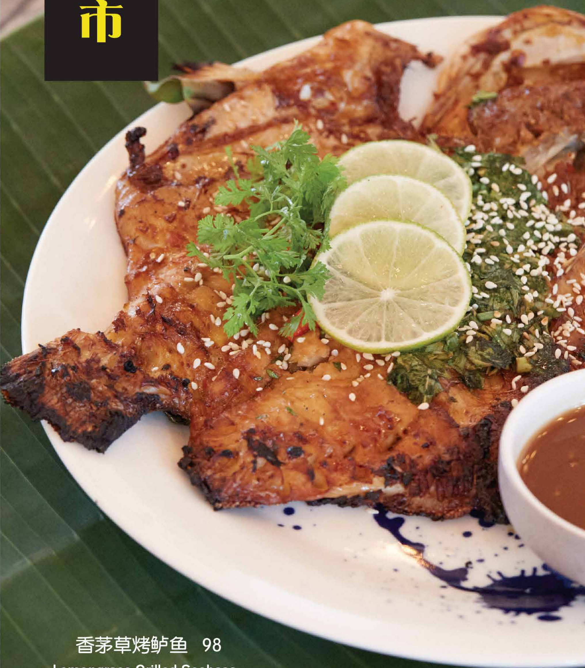
香茅草烤鲈鱼 98 Lemongrass Grilled Seabass