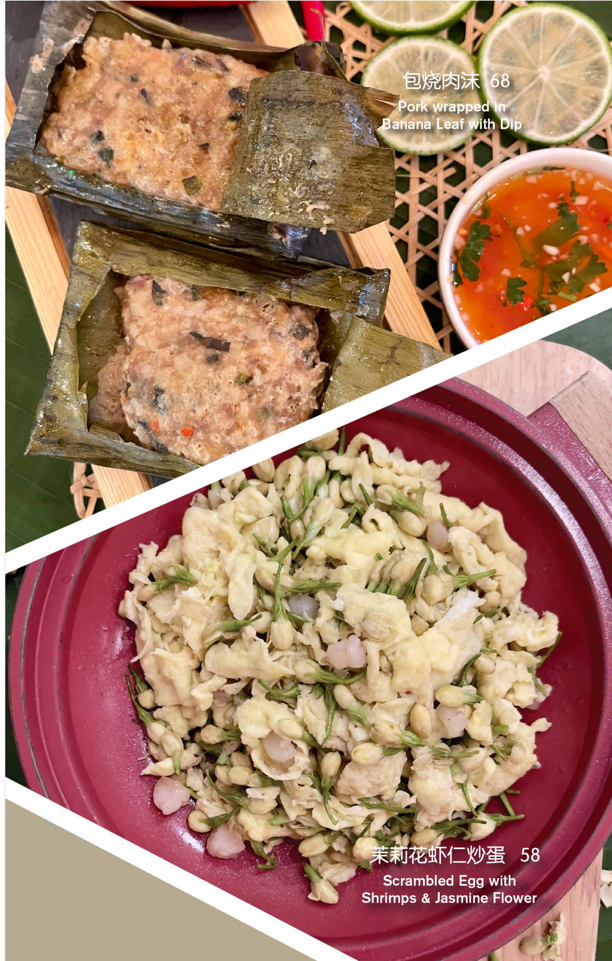
包烧肉沫 68 Pork wrapped in Banana Leaf with Dip