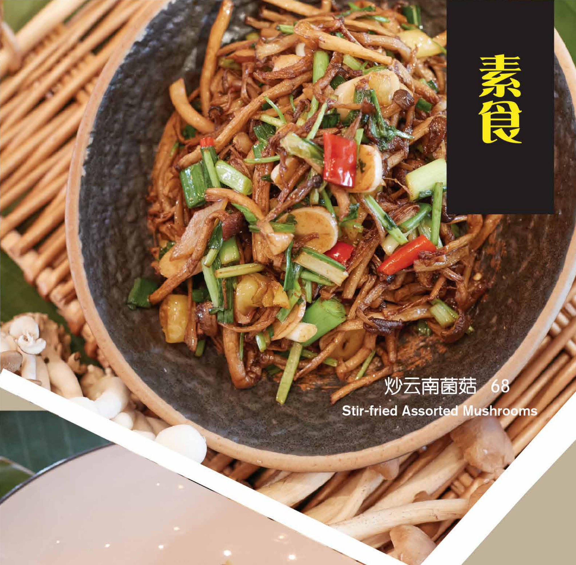
炒云南菌菇 68 Stir-fried Assorted Mushrooms