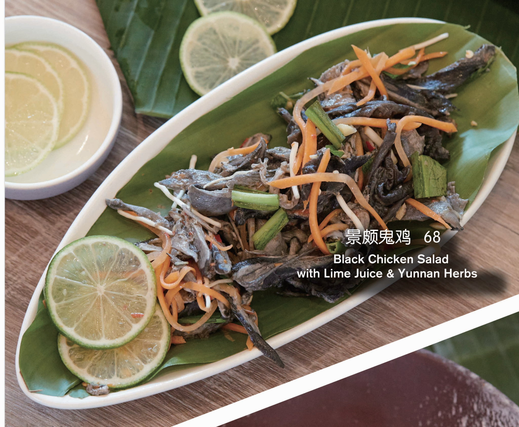
景颇鬼鸡 68 Black Chicken Salad with Lime Juice & Yunnan Herbs