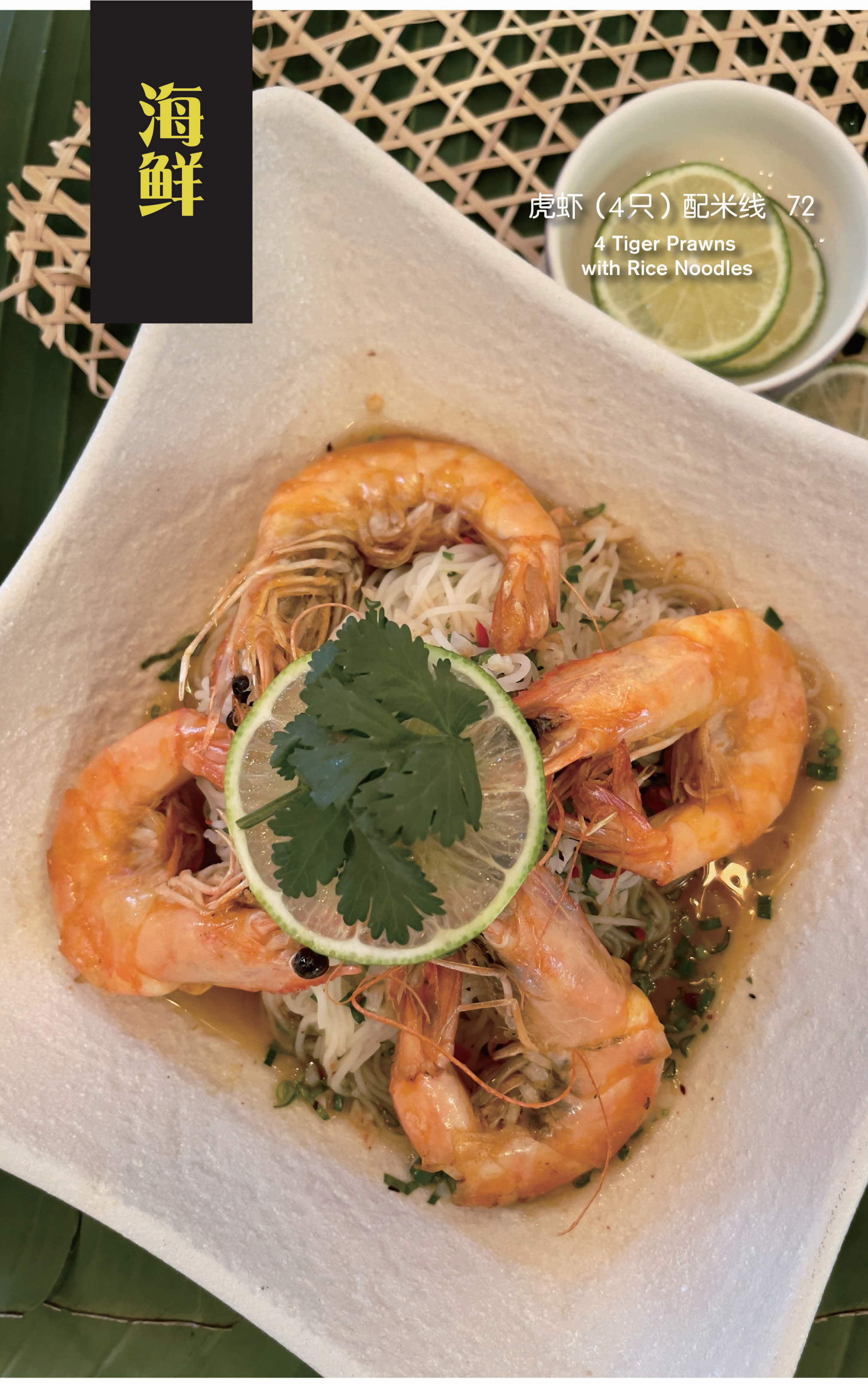
虎虾 (4只) 配米线 72 4 Tiger Prawns with Rice Noodles