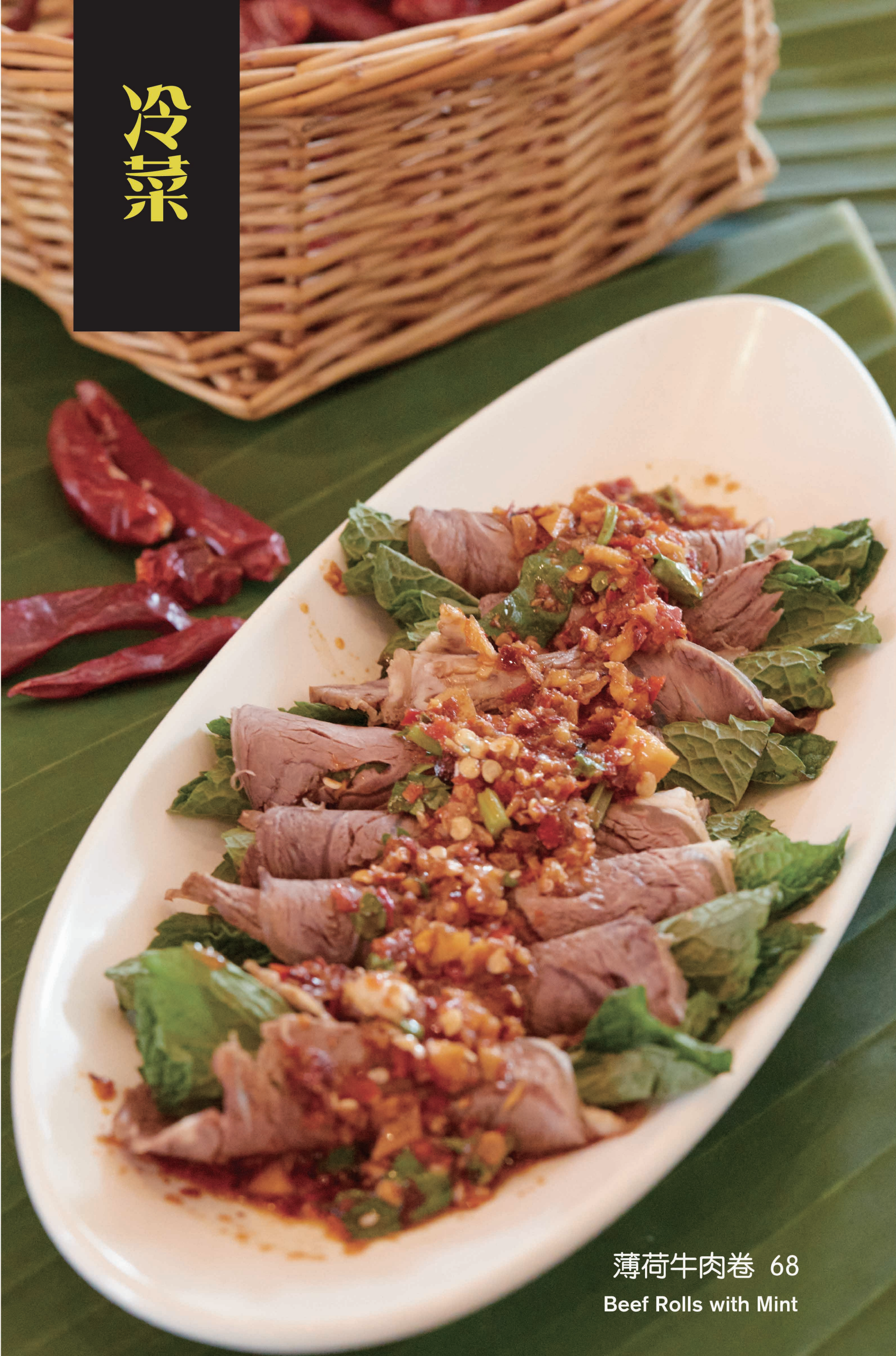
薄荷牛肉卷 68 Beef Rolls with Mint