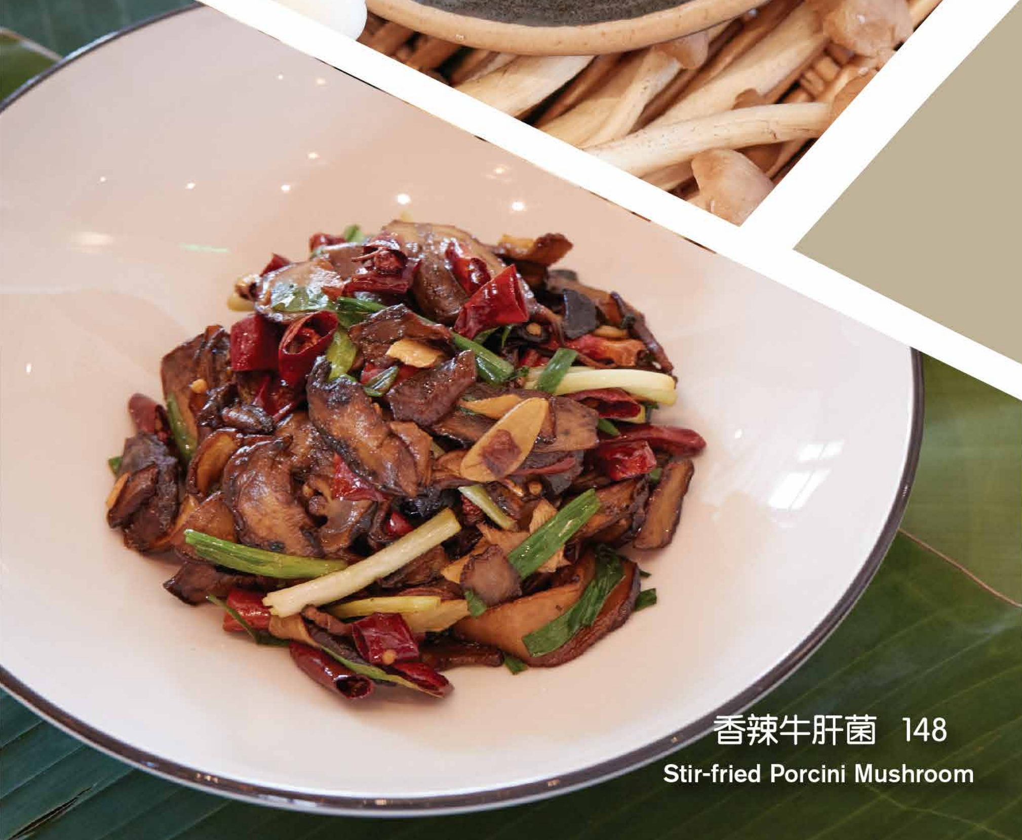
香辣牛肝菌 148 Stir-fried Porcini Mushroom