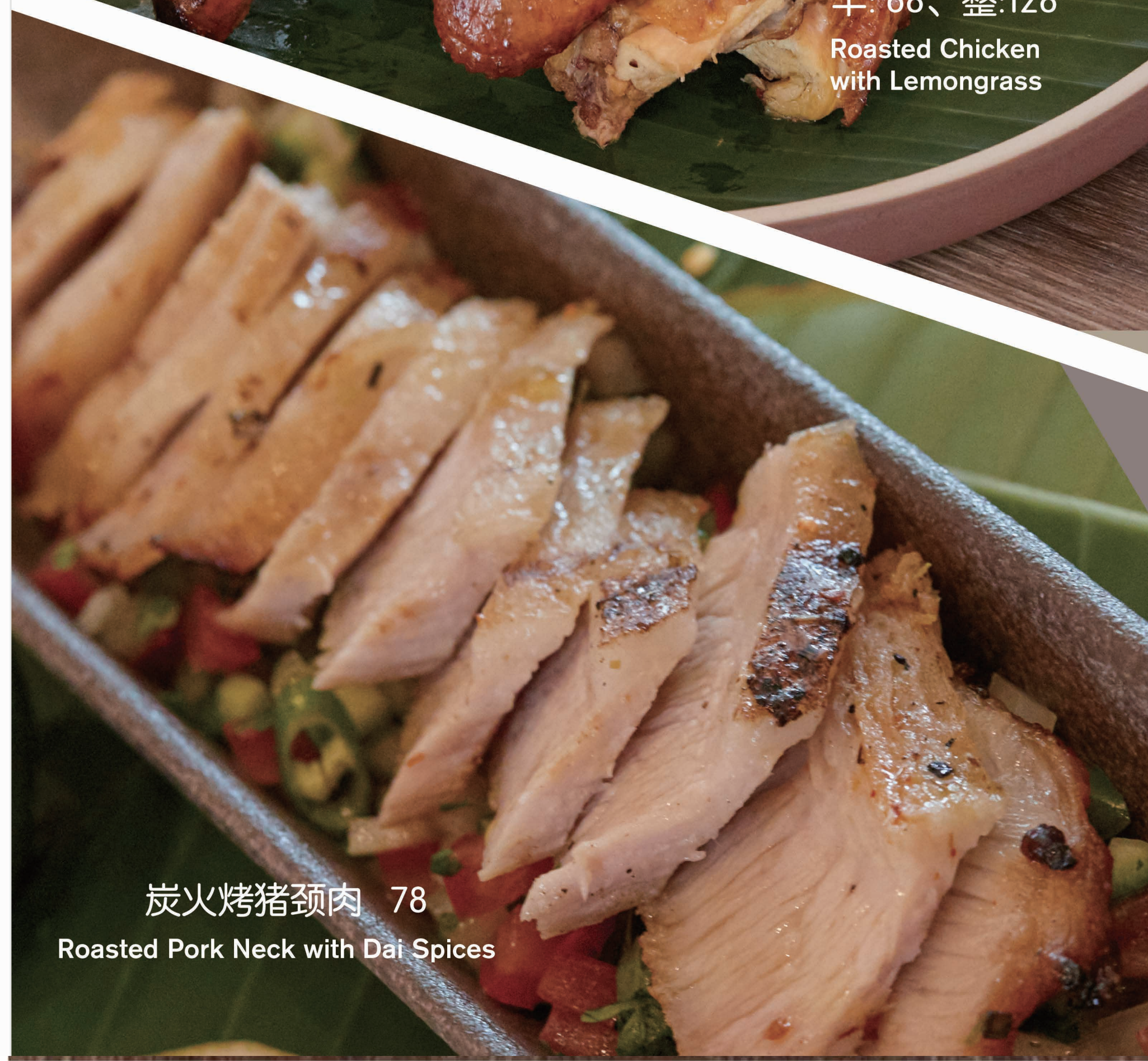
炭火烤猪颈肉 78 Roasted Pork Neck with Dai Spices