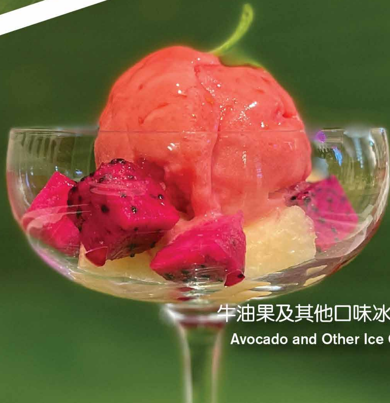
牛油果及其他口味冰淇淋 38 Avocado and Other Ice Creams