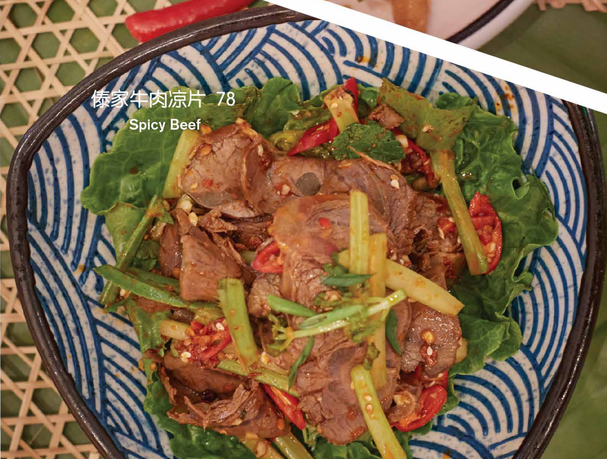
傣家牛肉凉片 78 Spicy Beef