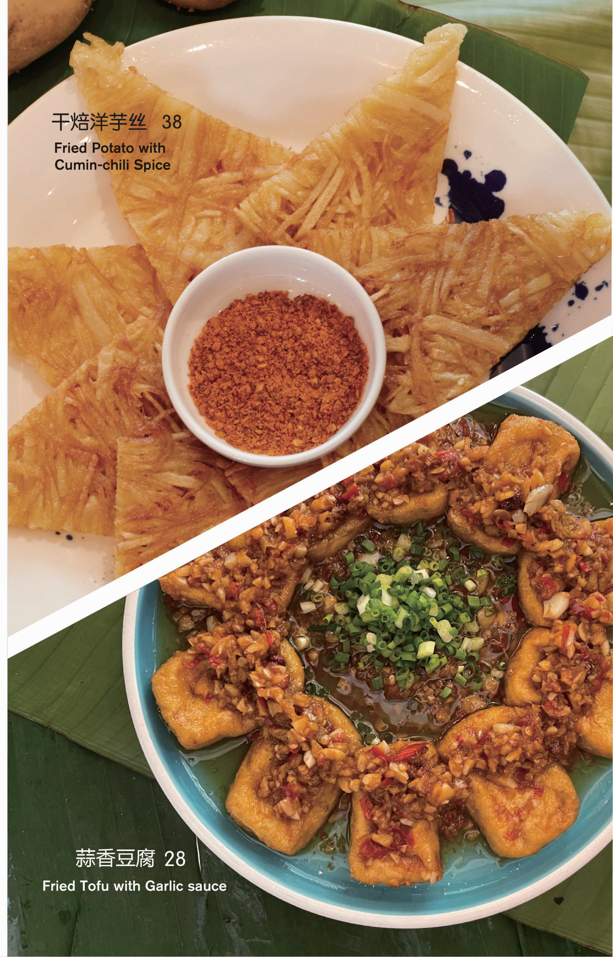
干焙洋芋丝 38 Fried Potato with Cumin-chili Spice