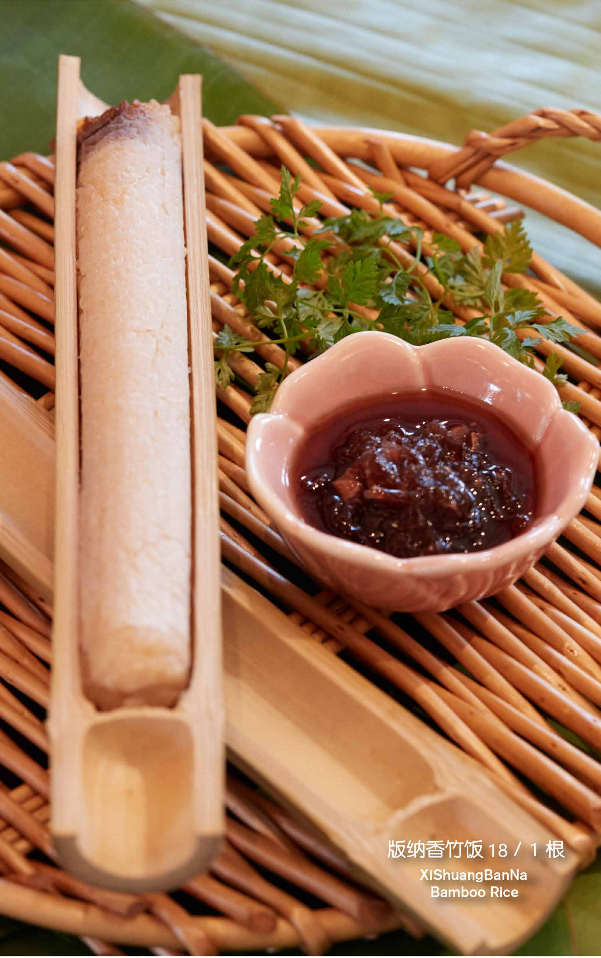
版纳香竹饭 18 / 1 根 XiShuangBanNa Bamboo Rice