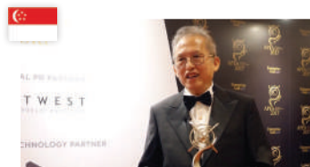
KWEK LENG BENG Executive Chairman Hong Leong Group

"This is a very good platform for entrepreneurs who wish to expand regionally. I am delighted to win this prestigious award. This accolade is made possible by the hard work and dedication of my team."