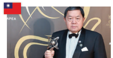
DOUGLAS TONG HSU Chairman & CEO Far Eastern Group

"I am humbled to receive this award, it means a lot to me and my employees. The event was wonderful, and it's one of the highlights in my life."