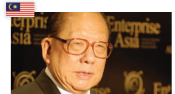
TAN SRI DATO' SERI DR. YEOH TIONG LAY Founder and Chairman YTL Corporation

"Top Glove will continue on our journey to be the number one rubber glove brand in the world. Thank you Enterprise Asia for awarding this Lifetime Achievement Award, encouraging me and my company to move forward."