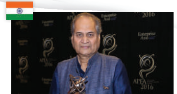
RAHUL BAJAJ Chairman Bajaj Group

"I am very grateful to Enterprise Asia for this honour. The APEA is not only a recognition to entrepreneurs, but also a platform for us to share, discuss and expand our ideas and ventures."