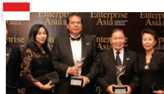
CHAIRUL TANJUNG Chairman and Founder CT Corp (Indonesia)

"We truly have evolved with the times and audiences' needs, which I believe demonstrates our ability to constantly innovate and adapt, ensuring exciting progress in days to come. Thank you Enterprise Asia for recognizing our effort and for empowering women like us by presenting me with the woman Entrepreneur of The Year award."