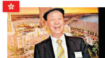
DR. LUI CHE-WOO Chairman & Founder K. Wah Group

"I am very honored to receive recognition from Enterprise Asia as a token of appreciation for my personal and my staff's contribution. My personal philosophy has always been to stay passionate about work, be fully dedicated, and strive to improve and work towards my goal, and tackle challenges positively so as to develop business."