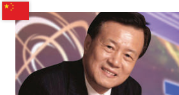
HUI WING MAU Chairman and Executive Director Shimao Group

"I am exceptionally glad and surprised to be awarded the Lifetime Achievement Award. All the best to APEA in becoming better every year, and being successful in promoting the spirit of Entrepreneurship."