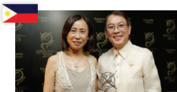
TONY TAN CAKTIONG Chairman Jollibee Foods Corporation

"I have been in this business for over 60 years and if you ask me 'what is a good business philosophy?' I would say: always build a business to last - put people first, be honest, be trustworthy and hardworking. This award will help me share this philosophy with other entrepreneurs, to further enrich our Asian entrepreneurship."