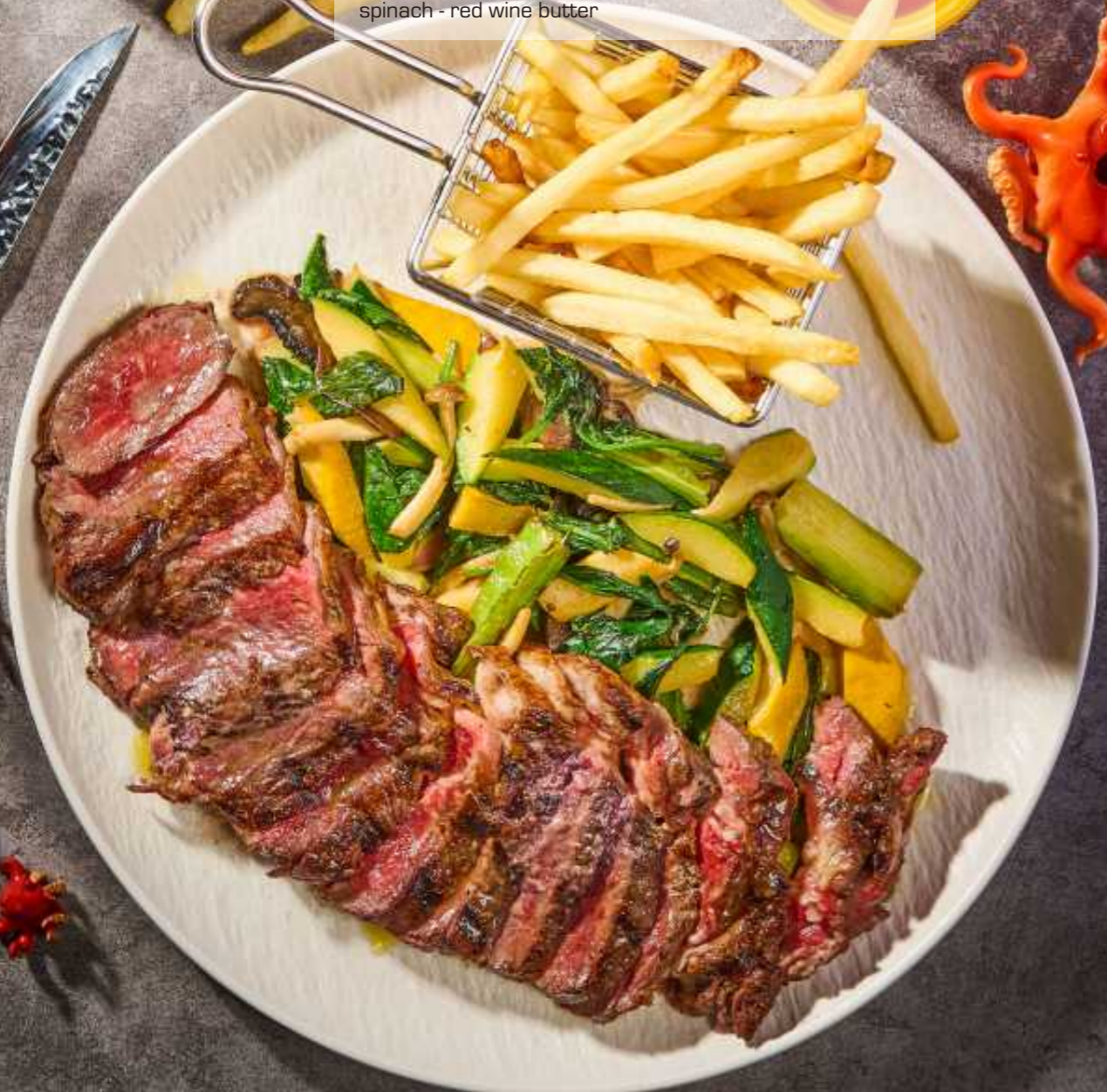
肉眼牛排 🍷 ¥448350g ¥348250g USDA PRIME RIB EYE 350 gm 美国谷饲牛肉 - 蒜香薯条 - 龙豆 - 菠菜 - 红酒黄油 American grain-fed rib eye - garlic fries - dragon beans - spinach - red wine butter