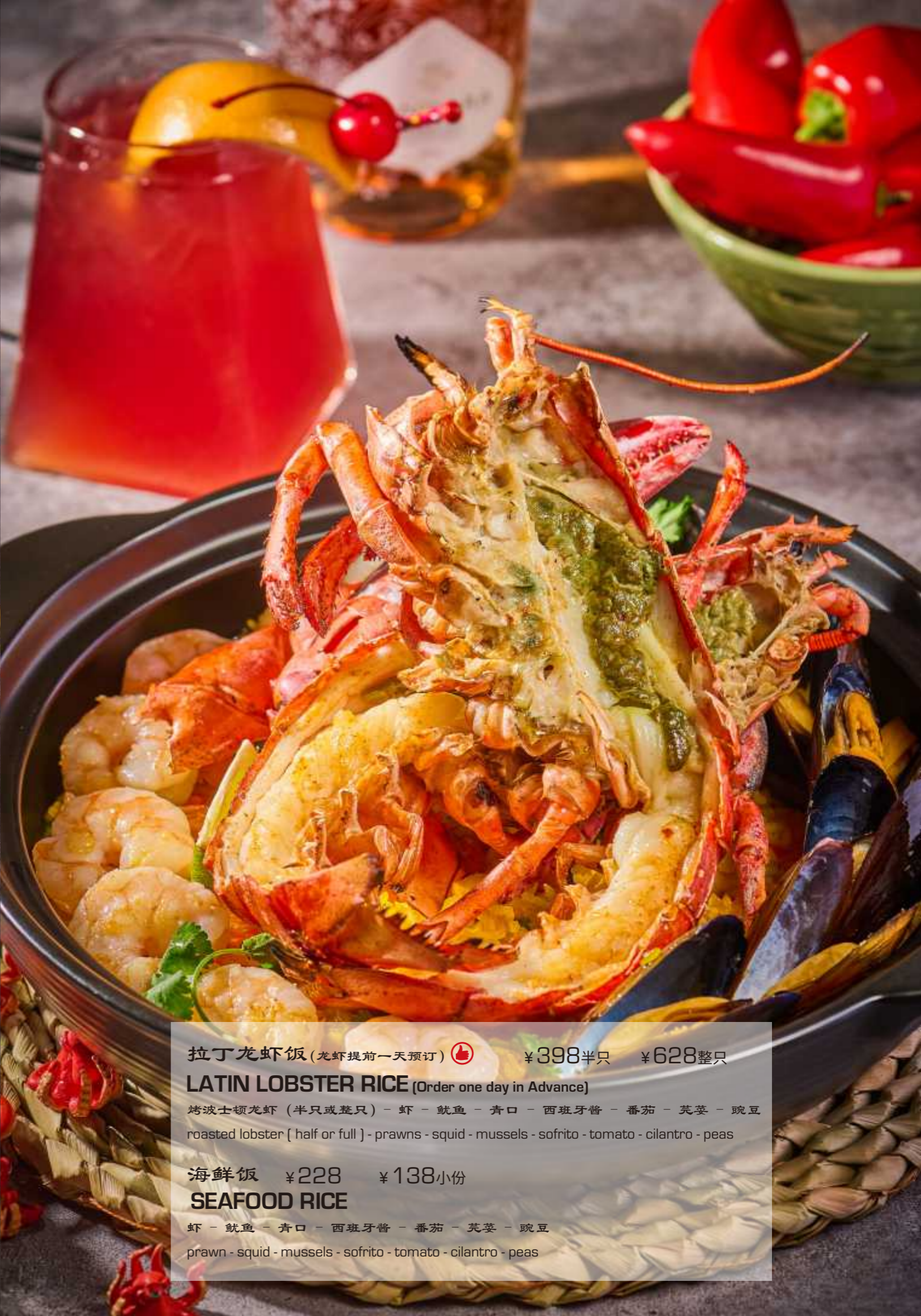
拉丁龙虾饭 (龙虾提前一天预订) 🍷 ¥398半只 ¥628整只 LATIN LOBSTER RICE (Order one day in Advance) 烤波士顿龙虾 (半只或整只) - 虾 - 鱿鱼 - 青口 - 西班牙酱 - 番茄 - 茼蒿 - 豌豆 roasted lobster ( half or full ) - prawns - squid - mussels - sofrito - tomato - cilantro - peas 海鲜饭 ¥228 ¥138小份 SEAFOOD RICE 虾 - 鱿鱼 - 青口 - 西班牙酱 - 番茄 - 茼蒿 - 豌豆 prawn - squid - mussels - sofrito - tomato - cilantro - peas