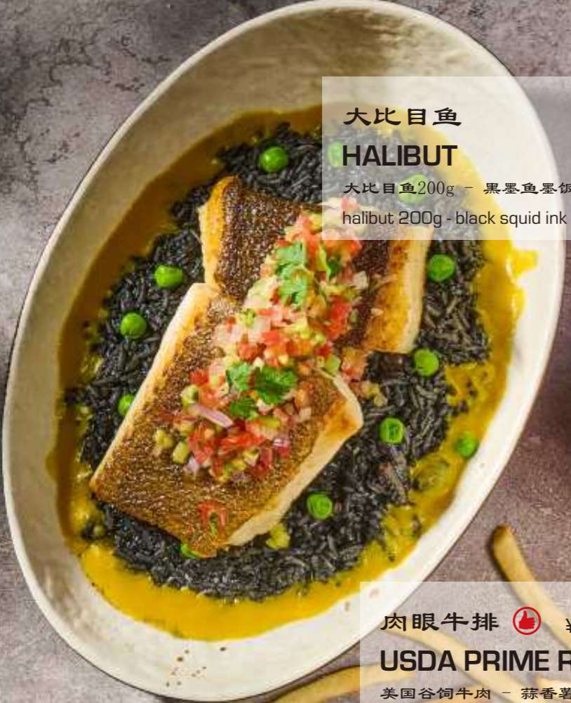
大比目鱼 ¥158 HALIBUT 大比目鱼200g - 黑墨鱼墨饭 - 番茄莎莎 - 黄辣椒酱 halibut 200g - black squid ink rice - tomato relish - yellow chili sauce